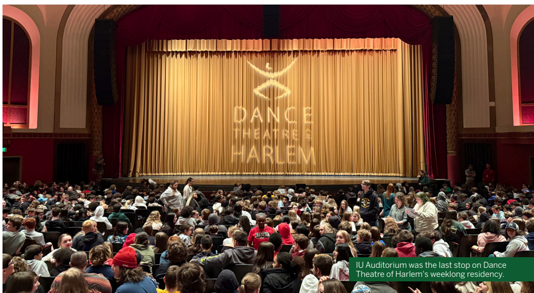
IU Auditorium was the last stop on Dance Theatre of Harlem's weeklong residency.