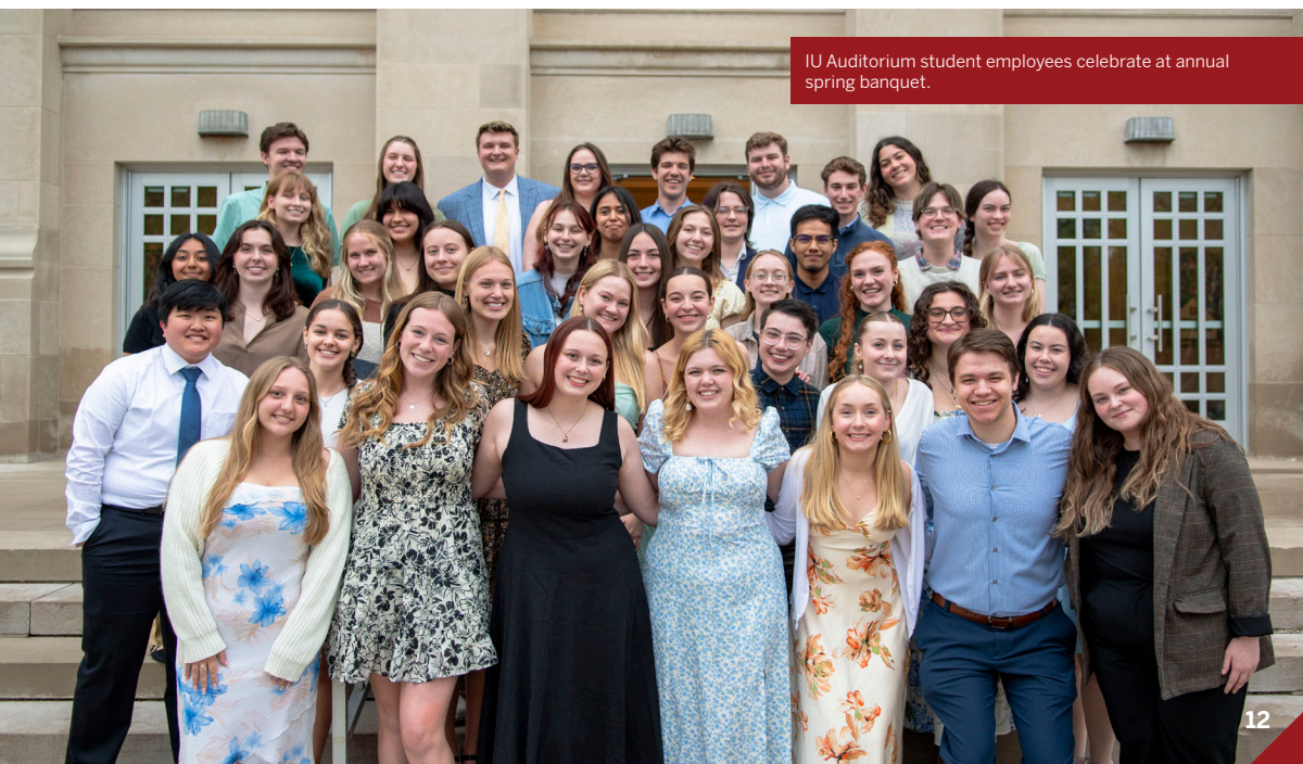
IU Auditorium student employees celebrate at annual spring banquet.